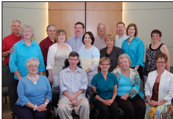
Faith Weavers Class

The Open Doors class is a group of young adults, both singles and couples, who come together to study, question, and grow together in Christian faith. This group emphasizes application of the Christian faith to real life issues, and studies both the Bible and Christian books. Open Doors class members get together regularly for fun and fellowship outside of church, and participate in a variety of mission projects. (Ages 22 - 35)